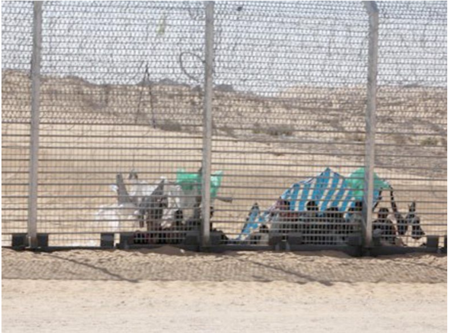
The 21 asylum seekers, detained at the border

Eritrea's human rights record is one of the world's worst. Several human rights violations are committed by the government or on behalf of the government. Freedom of speech, press, assembly, and association are limited. Those that practice "unregistered" religions, or escape military duty which is obligatory between the ages of 16 to 55, are arrested and put into prison. Well known prisoners are usually held in underground cells and less known prisoners are usually put together in cargo containers or in very overcrowded prisons that are sometimes located underground, and suffer from extreme heat (during the day) and cold (during the night) conditions. In addition to the harsh imprisoning conditions, torture, murder, and vengeance against the prisoners' families are common treatments imposed by the state.