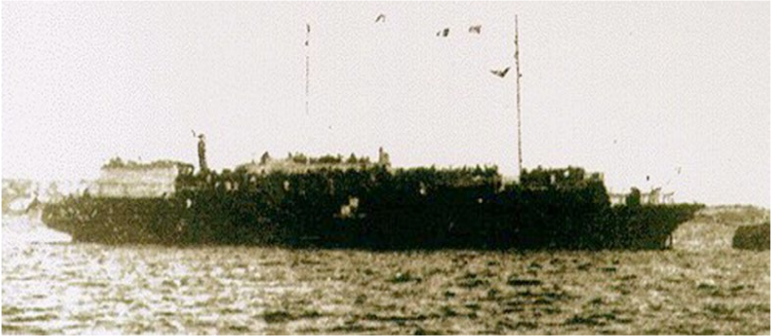
A photo thought to be of the Struma